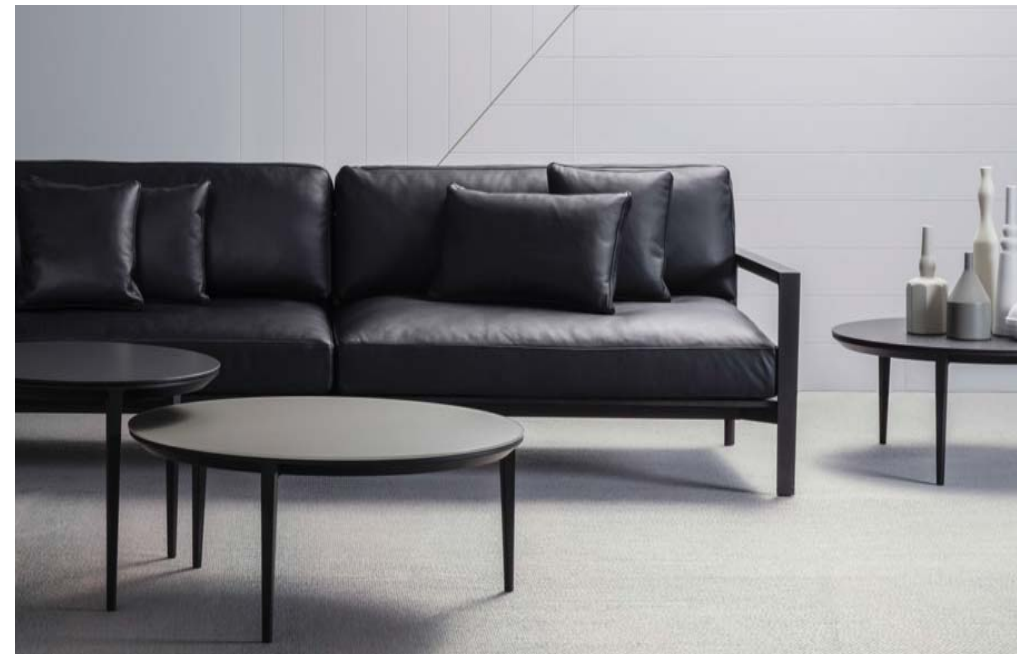
LING (ABOVE) MAX (LEFT)