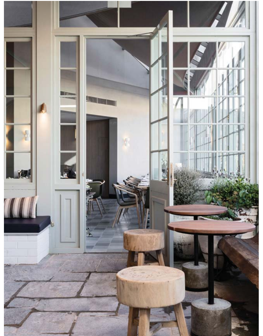
BUENA VISTA HOTEL SJB WITH TESS REGAN DESIGN SYDNEY, AUSTRALIA