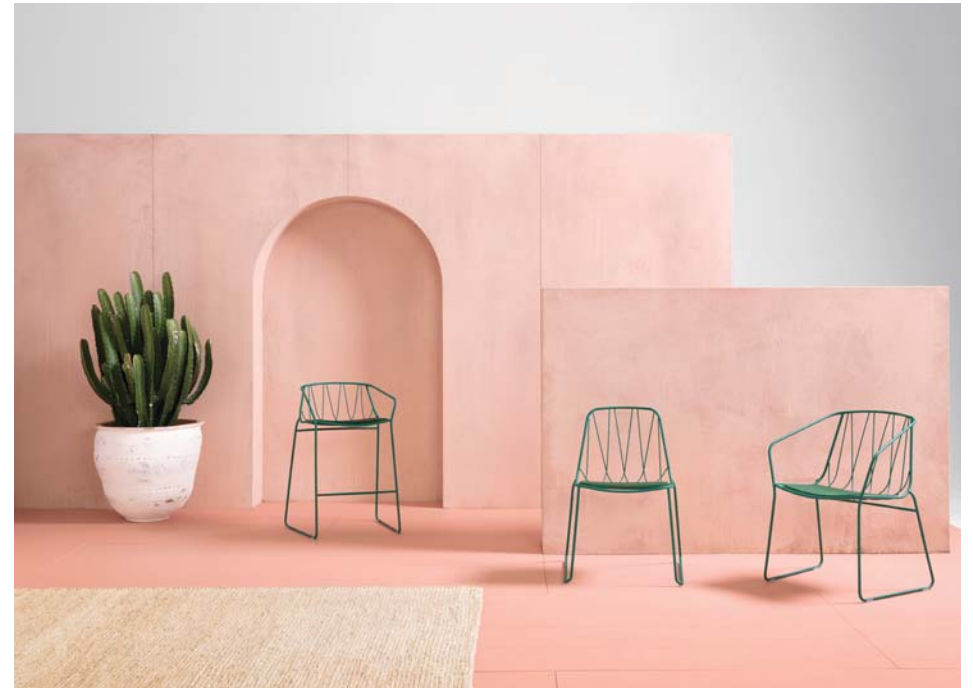
JEANETTE CHAIR (LEFT)

(BELOW) CHEE CHAIR CHEE WITHOUT ARMS CHEE BAR STOOL