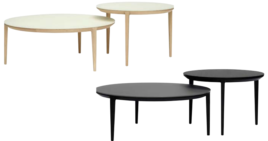
ETOILE COFFEE TABLE