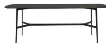
PARISI TABLE (LEFT)