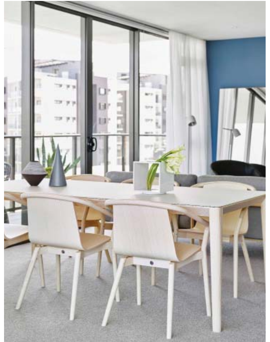
UNISON APARTMENTS MIRVAC BRISBANE, AUSTRALIA